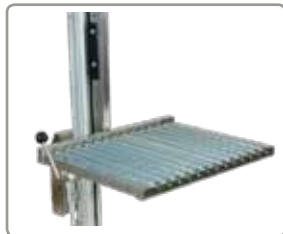
Roll platform, with side-feed