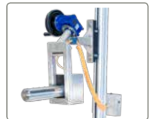
Expand&Turn - Pneumatic expander, turing operated manually

Flexibility - choose mast height, and width & length of legs