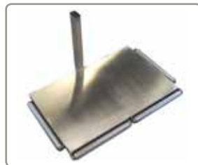
Platform with edge rolls