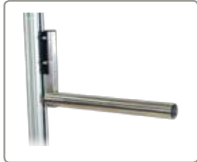
Prong for roll handling

We have a large number of standard tools such as load platform, forks, control and counting scale and Squeeze&Turn and our pneumatic expandable Expand& Turn. We also manufacture customized tools in accordance to your specifications.